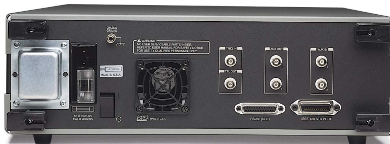
SR844 rear panel